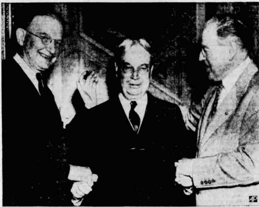
California's veteran Senator Hiram W. Johnson (center) was the envy of most of his colleagues in Washington as a result of his apparent triple victory in the California primary election, wherein he captured both the Republican and Democratic nomination and held a huge lead on the progressive ticket to succeed himself for a fifth term. Shown here congratulating him are Senator Burton K. Wheeler, Montana Democrat and Senator Warren R. Austin (right), Vermont Republican.