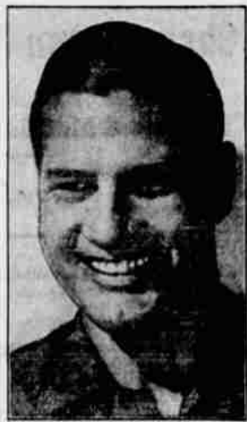
Handsome Star of Universal Productions