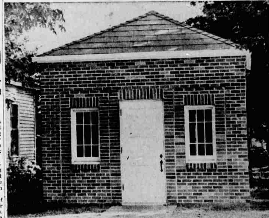
The new building (above), has been constructed at Jacksonville to house the Jacksonville dial equipment.