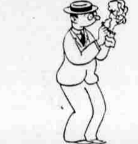
GOES THROUGH WHOLE PROCEEDING AGAIN IN REVERSE, AND IS FORCED TO MOP HIMSELF UP WITH HANDKERCHIEF, ICE CREAM HAVING STARTED TO MELT