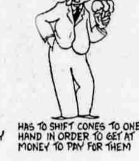
HAS TO SHIFT CONES TO ONE HAND IN ORDER TO GET AT MONEY TO PAY FOR THEM