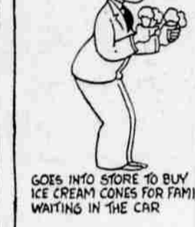
GOES INTO STORE TO BUY ICE CREAM CONES FOR FAMILY WAITING IN THE CAR