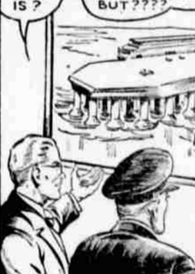
CORRECT! IT'S THE NEW INTERNATIONAL SEADROME IN MID-ATLANTIC, AND IT HAS HOTEL ACCOMMODATIONS FOR TRANS-OCEANIC PASSENGERS. IT WAS ANCHORED AT THAT SPOT YESTERDAY... BY THREE-POINT-TRANS-ATLANTIC AIRWAYS!