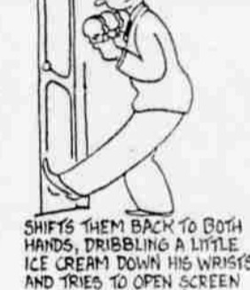
SHIFTS THEM BACK TO BOTH HANDS, DRIBBLING A LITTLE ICE CREAM DOWN HIS WRISTS, AND TRIES TO OPEN SCREEN DOOR WITH HIS FOOT