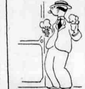
HAS TO SHIFT CONES AGAIN IN ORDER TO UNLATCH DOOR, GETS THROUGH AND RE-SHIFTS CONES, CLERK CALLING HE'S FORGOTTEN HIS CHANGE