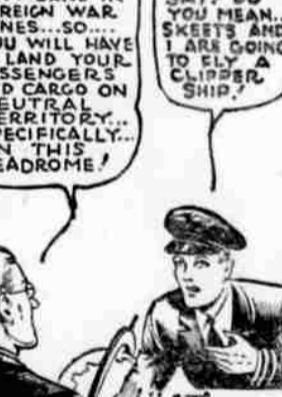
...WILL HAVE TO SAY? DO YOU MEAN, SKIRTS AND I AM GOING TO FLY A CLIPPER SHIP?