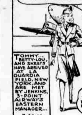
WHY ALL THE MYSTERY OF OUR FLIGHT HERE, PAN? THE CHIEF SAID YOU'D GIVE US FURTHER INSTRUCTIONS.