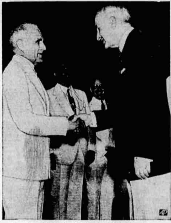
Secretary of State Cordell Hull (right) is shown being presented to President Federico Laredo Bru (center) of Cuba at a reception given in the presidential palace in Havana in honor of delegates to the inter-American conference. The conference of 21 American republics opened for discussions of economic and diplomatic solidarity in the western hemisphere.