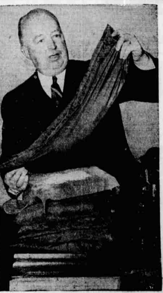
Paul E. Madden, chief of the California narcotics enforcement division, is shown above with the rubberized silk bags containing 17 pounds, 3 ounces of narcotics seized aboard a Japanese freighter in San Francisco. Madden placed wholesale value of the dope at $81,000. He hinted the case would have international ramifications and involved contraband worth more than $1,000,000 when it was "cleaned up."