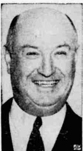
ENIGMA—Big Jim Farley, hand-shaking postmaster with countless friends, is known for his loyalty to F.D.R., some secret political ambitions, and for opposition to a third term.