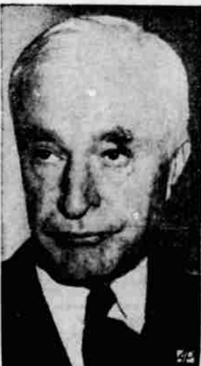
VETERAN—Age of Secretary of State Cordell Hull—his 65—might cripple his chances. The Tennessee statesman has repeatedly expressed his disinterest in a political future.