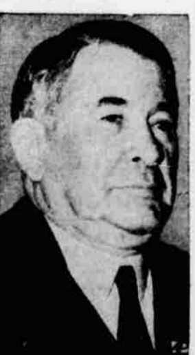
EXPERIENCED—Sen. Alben W. Barkley of Kentucky, who'll probably be permanent chairman of Democratic convention, gave keynote talks in 1932 and 1934.