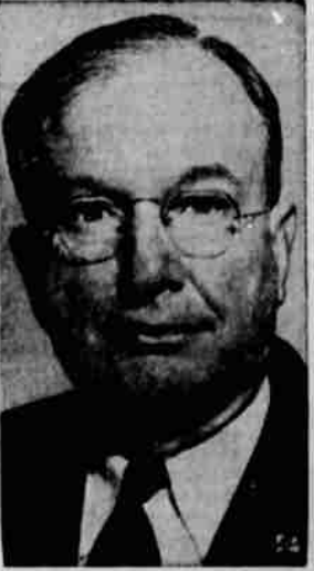
HE'LL RUN—Whether F.D.R. runs or not, Sen. Burton K. Wheeler (above) of Montana says he'll seek presidential nomination. He's advising Democrats to become a "peace party."