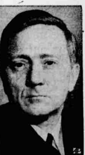
JUSTICE—If Roosevelt decides against a third campaign, and the Democrats decide to put youth in the saddle, Supreme Court Justice William O. Douglas might be considered. He's 41.