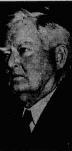
STRATEGIST—Although little came of an early boom for Vice President John Garner, he has influence in party councils and will probably wield power when nominating is named.