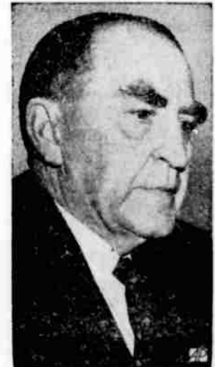
ORATORY—Keynote for the Democrats' national convention opening July 15 in Chicago will be Alabama's William B. Bankhead, House speaker, who's considered a fine orator.