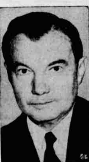
MENTIONED—The name of Attorney General Robert Jackson (above) has figured in stories about Democratic nominations. He's been mentioned as a possible vice president.