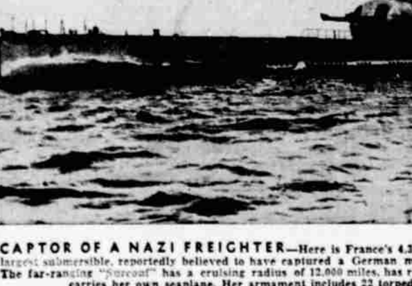
CAPTOR OF NAZI FREIGHTER—Here is France's 4,300-ton submarine, the world's largest submarine, reportedly believed to have captured a German merchant ship in the Atlantic.

Auto, Plate and Window Glass installed reasonably. Medford Plate Glass & Mirror Co., 36 So. Bartlett