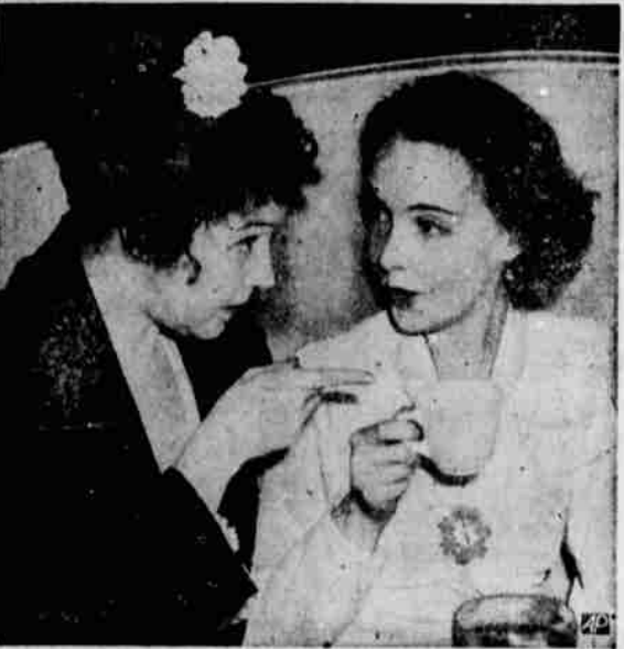
POINTED CRITICISM —Finger-wagging Dorothy Gish gave her sister Lillian some friendly advice about the latter's acting after a performance in Chicago. Many hearts throbbled to the Gish Girls in the silent movie days.