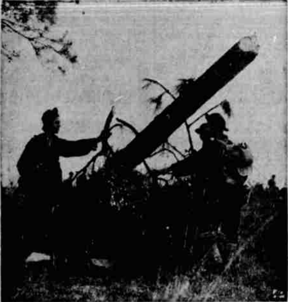
NOW IF IT WERE REAL! —A tree trunk served as dummy gun for this camouflaging drill at Fort Benning, Ga.