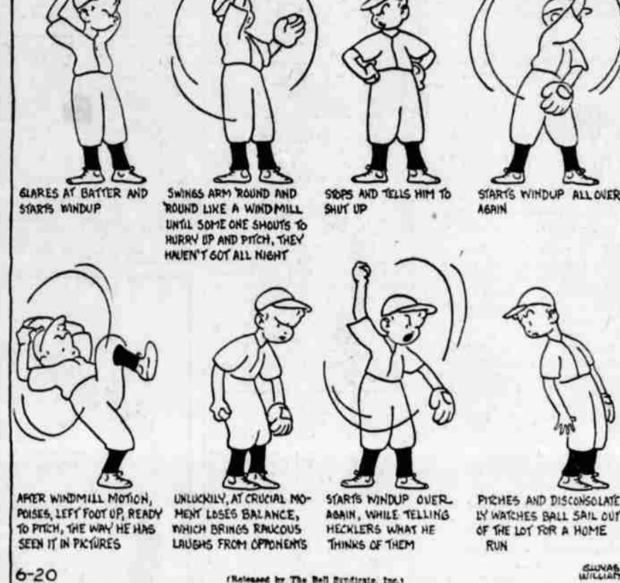
6-20 (Released by The Bell Syndicate, Inc.)