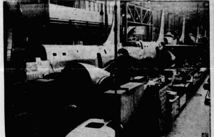
SPEED ON THE LINE—Stepping up airplane production is major undertaking of nation's new defense program, so assembly lines like this one in the Douglas Aircraft plant at Santa Monica, Calif., work full tilt. They are bombers taking shape in final assembly room. At extreme left is a wing section. Big demand is for training planes to school pilots.