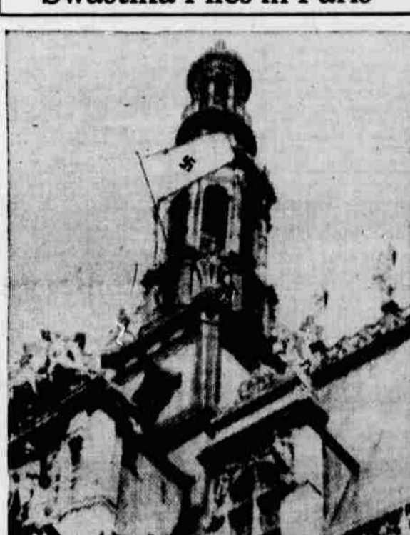
This photo radioed from Berlin to New York says it shows the German Swastika flag flying on the tower of the Paris city hall after Nazi occupation of the beautiful French capital.