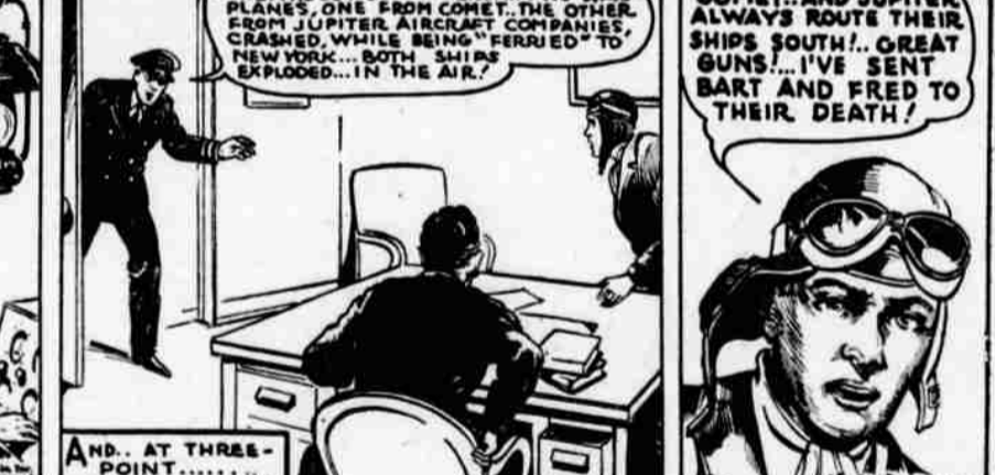
By EDWIN ALGER