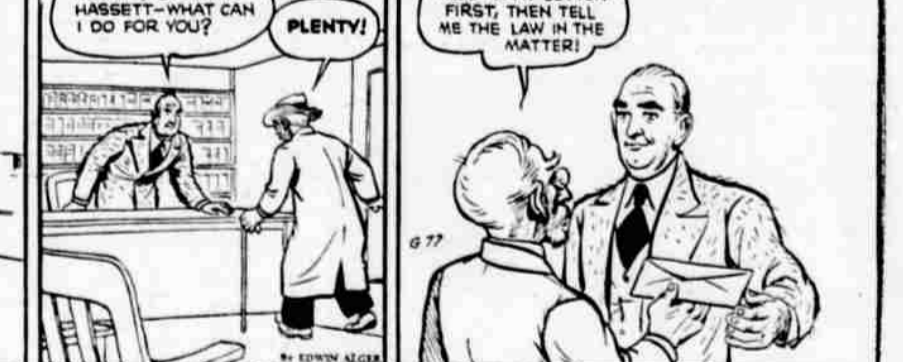
By EDWIN ALGER