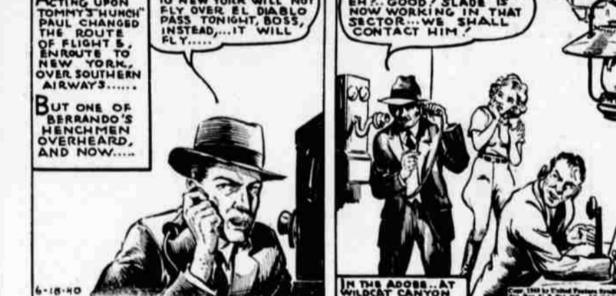
By HAL FORREST