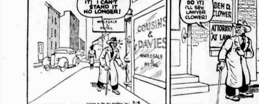
By EDWIN ALGER