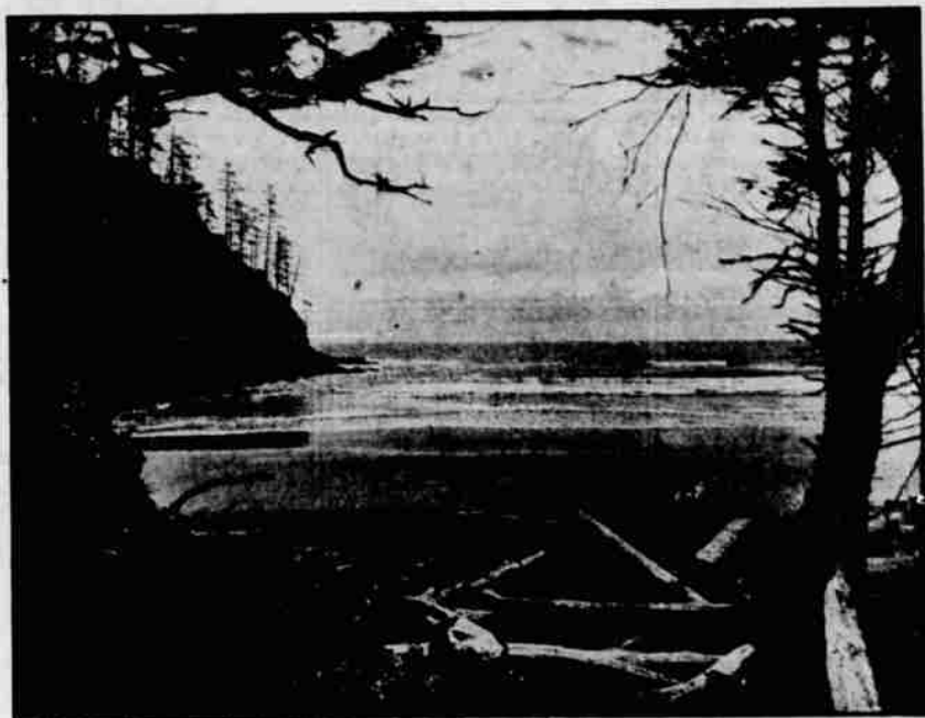
"Short Sand beach hides at the base of the northern face of Neahkahnie mountain and is cut off now by construction of the spectacular highway across the seaward cliff . . ."

Starting shortly after noon Friday in the Oregon State Motor association's travel development car, we dropped down the Wolf creek highway to the coast, climbing Saddle mountain as far as the end of