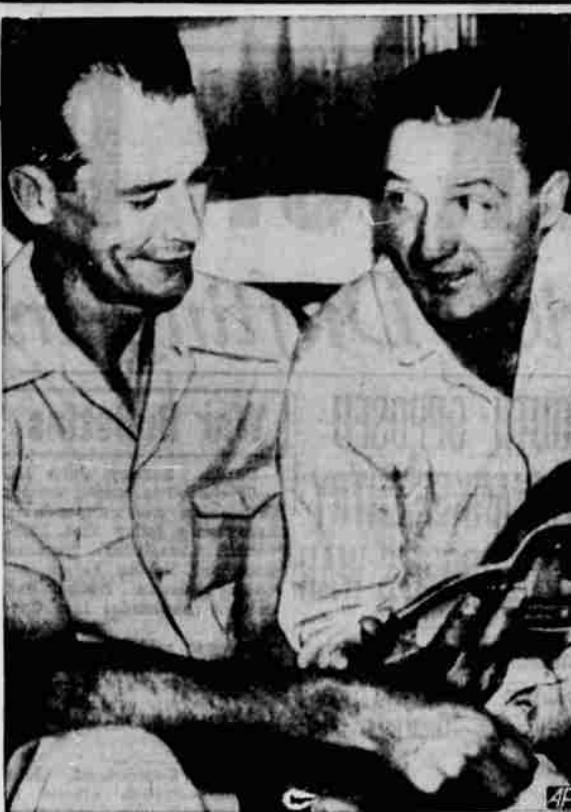
Pitcher Curt Davis, left, and outfielder Joe Medwick, right, are shown as they consulted a timetable after they received the news aboard a train in Buffalo, N.Y., of their trade to the Dodgers by the Cardinals.