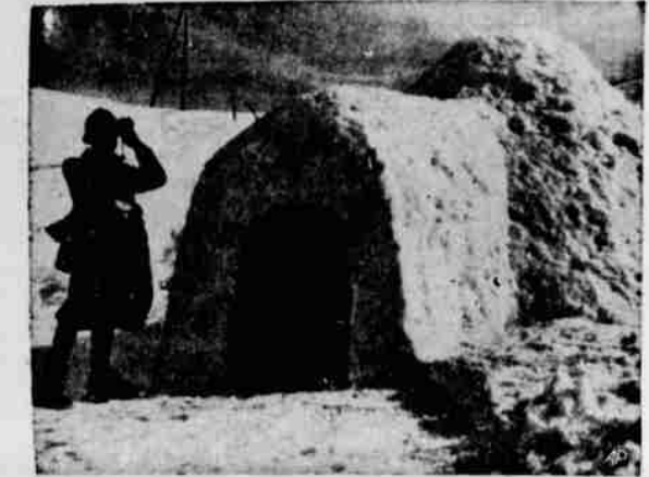
IN THE FRENCH ALPS —Outside a snow house that looks like an Eskimo igloo stands a French soldier on duty in the French Alps. Italy's recent order that her Alpine defenses be strengthened has pulled attention to this region.

I'LL NEVER APOLOGIZE!! THERE'LL BE NO LIVING WITH THEM IF I DID BUT I WOULD TALK THE MATTER OVER QUIETLY WITH THEM POWER PILL COMPANY HEADING FOR ROCKS'—LOOKS LIKE THIS GUY NEBB QUARRELED HIMSELF OUT OF A FORTUNE. HE'S A GUY WHO COULD DO IT NORTHVILLE DAILY G SIT-DOWN STRIKE STOPS POWER PILL PRODUCTION POWER PILL COMPANY HEADING FOR ROCKS BECAUSE RUDOLPH NEBB REFUSES TO APOLOGIZE TO EX-WAITRESS... HERE IS STORY AS OUR REPORTERS GOT IT... INDUSTRY GUARDIAN REPORTS OF NEBB'S UNPLEASANT VISIT TO THE POWER PILL CENTER... I'D LIKE TO KNOW WHO GAVE THIS STORY TO THE PAPER... NOW ALL AMIABLE ADJUSTMENT IS IMPOSSIBLE AND OUT THEY GO!