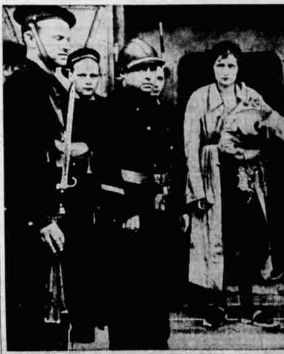
The French censor-approved caption says this picture shows a Belgian girl, convicted of treason, with her executioners before she was shot. Standing beside her is a squad of French marines, with helmeted corporal in center identified as the head of the firing squad. The scene is in front of Dunkerque for, while the French still controlled.