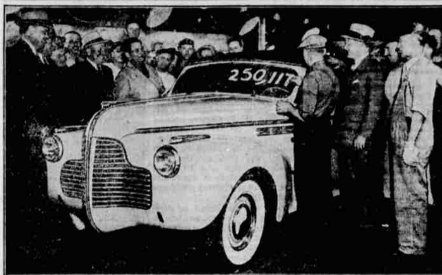
WHEN BUICK'S 1940 model Number 250,117 rolled off the assembly line this week the all time high production record, established in 1927, was exceeded and this manufacturer moved into new high ground from a volume standpoint. Photo shows the milestone car moving off the assembly line in Flint in the presence of company executives and workmen. At the extreme left are W. F. Hufstader, general