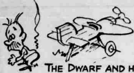
THE DWARF AND HIS MODEL AIRPLANE