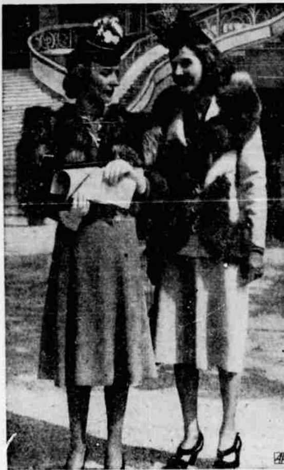
MODISH PARIISIENNES —War or no war, a horse race brings out style-conscious French girls. These were at Longchamps.