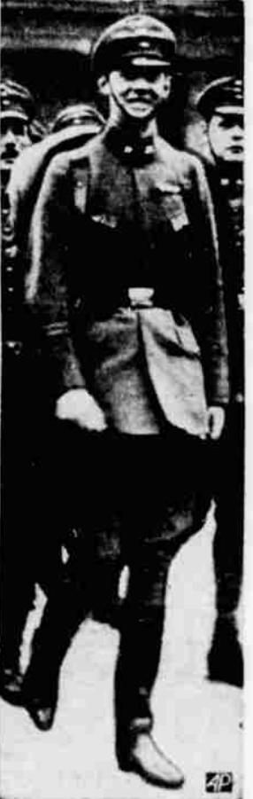
The death of Prince Wilhelm (above) of Prussia, grandson of the ex-Kaiser Wilhelm, was announced in Berlin. The prince was fatally wounded while fighting in Flanders.