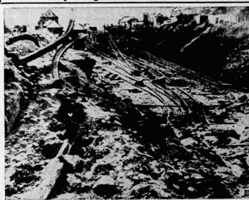
Berlin described this scene as a view of a section of a railway line destroyed by retreating Belgian soldiers, somewhere in Belgium. Germans and Allies, meanwhile, were locked in the Battle of Flanders.