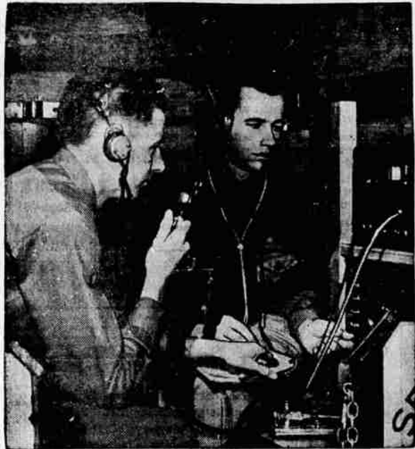
Grange County Boy Scouts had their own portable short-wave broadcasting unit always available as an emergency unit whenever it may be required. This year, as they did last year when cars battled through a blizzard and lines were down, the scouts did a good turn by keeping the Run officials in communication with the location of the cars during the course of the Gilmore-Yosemite run. Here is shown two of the youthful broadcasters at their post.