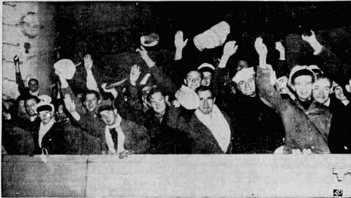
Survivors of the sunken German liner Columbus are shown lining the rail of the rescuing U. S. cruiser Tuscaloosa as the warship steamed up New York harbor. The 579 Germans, with the status of "castaways" were expected to be allowed the freedom of the United States for 60 days.