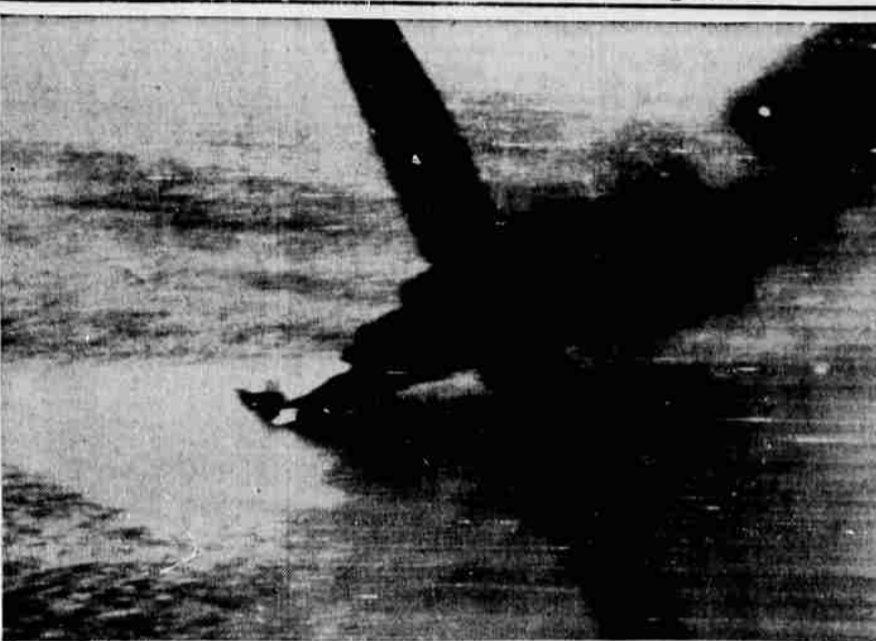
Taken from an airplane and sent from Buenos Aires to New York by radio, this picture shows the German pocket battleship Admiral Graf Spee as she burned and sank off Montevideo, Uruguay harbor. The vessel was destroyed by her own crew on orders of Adolf Hitler.