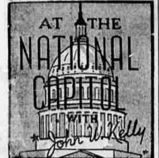
AT THE NATIONAL CAPITOL

Washington, D. C., Dec. 18.—In two weeks holders of social security cards, if they are 65 years, will begin drawing monthly benefits. Commencing January 1, 1940, each holder of a card will automatically receive monthly payments as he or she arrives at the 65th birthday. By an amendment to the act last August, the payments were advanced two years. The benefits will also flow monthly to widows, wives, minor children and orphans—dependents on the holder of a card.