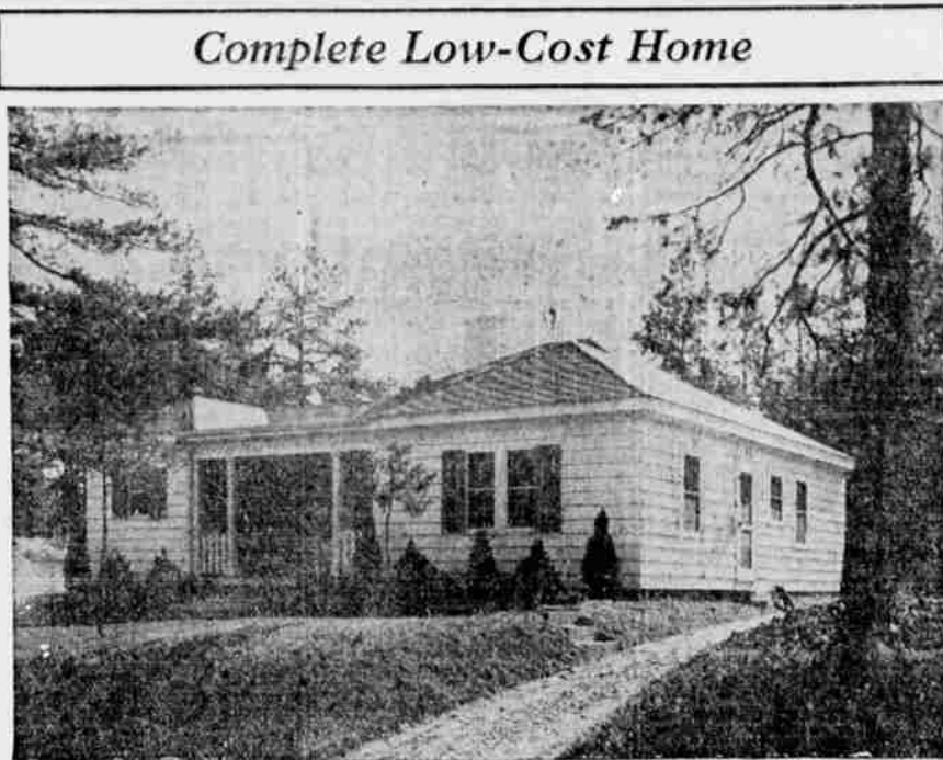
Complete Low-Cost Home

More detailed information on the publications cited may be supplied by retail lumber dealers in any community, or by writing Western Homes Foundation, 364 Stuart Building, Seattle, Wash.