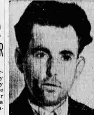
George Elser (left) was accused by German secret police as the man who set the bomb in the Munich beer hall Nov. 8 which took eight lives and which exploded just 11 minutes after Adolf Hitler left. Also accused were two British secret service agents, Capt. Richard Henry Stevens (center) and Sigismund Payne Best (right), seized by Nazis on the German-Dutch frontier.

According to orders issued by local authorities, these two districts must be "Jew-free" by the middle of December. The Jews may take only the scantiest belongings.