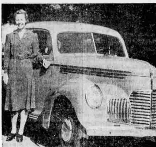
Speaking of versatile champions, attractive Alice Marble who in addition to her athletic conquests is an accomplished night club singer and radio entertainer, describes her new Studebaker Champion as a versatile winner in the field of economy and performance.