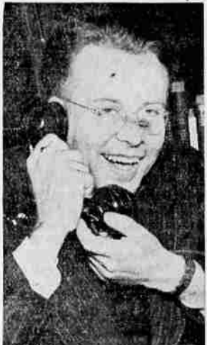
Dr. Ernest Orlando Lawrence of the University of California, Berkeley, Calif., is shown receiving congratulations on his winning the Nobel prize in physics for creation and use of the atom-smashing cyclotron.