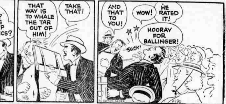
By EDWIN ALGER