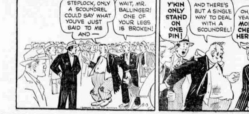
THE NEBBES—Now I'll Tell You