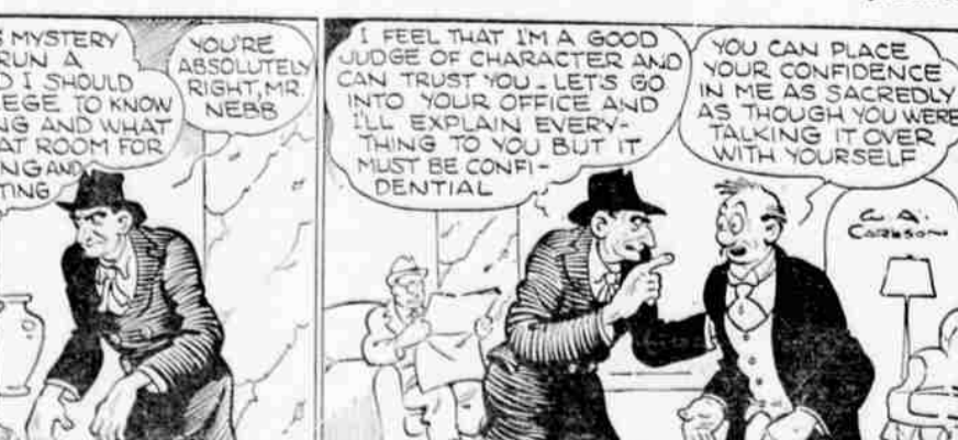
By SOL HES