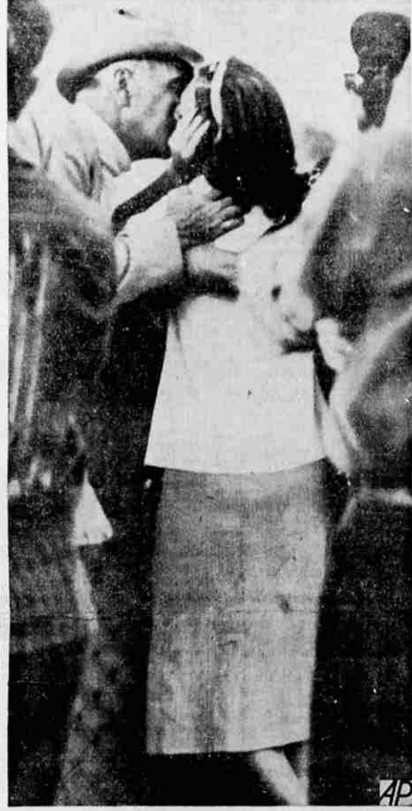
On the same day she filed suit for divorce, charging extreme cruelty, Ruby Keeler went to Union Air Terminal in Los Angeles to bid a tearful farewell to Al Jolson as he left for New York. They're shown embracing just before Jolson boarded the plane.