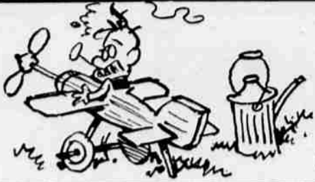
THE DWARF AND HIS MODEL PLANE

Copyright 1939—by Fontaine Fox, Trade Mark Reg. U. S. Pat. Off. Great Britain Rights Reserved