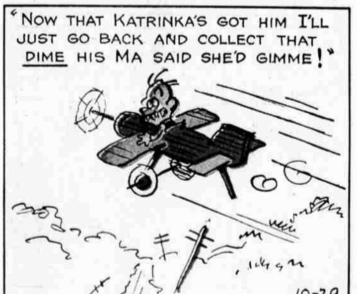
"NOW THAT KATRINKA'S GOT HIM I'LL JUST GO BACK AND COLLECT THAT DIME HIS MA SAID SHE'D GIMME!"