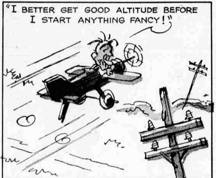
"I BETTER GET GOOD ALTITUDE BEFORE I START ANYTHING FANCY!"