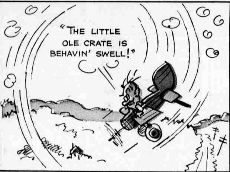
"THE LITTLE OLE CRATE IS BEHAVIN' SWELL!"