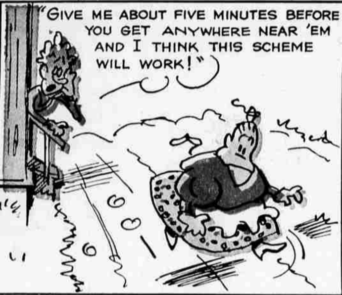
"GIVE ME ABOUT FIVE MINUTES BEFORE YOU GET ANYWHERE NEAR 'EM AND I THINK THIS SCHEME WILL WORK!"