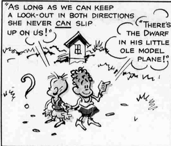
"AS LONG AS WE CAN KEEP A LOOK-OUT IN BOTH DIRECTIONS SHE NEVER CAN SLIP UP ON US!"