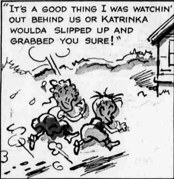
"IT'S A GOOD THING I WAS WATCHIN' OUT BEHIND US OR KATRINKA WOULD'A SLIPPED UP AND GRABBED YOU SURE!"

Copyright 1939—by Fontaine Fox, Trade Mark Reg. U. S. Pat. Off. Great Britain Rights Reserved