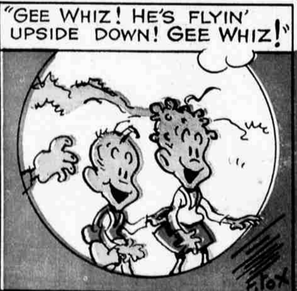
"GEE WHIZ! HE'S FLYIN' UPSIDE DOWN! GEE WHIZ!"