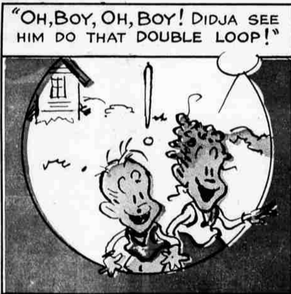
"OH, BOY, OH, BOY! DIDJA SEE HIM DO THAT DOUBLE LOOP!"