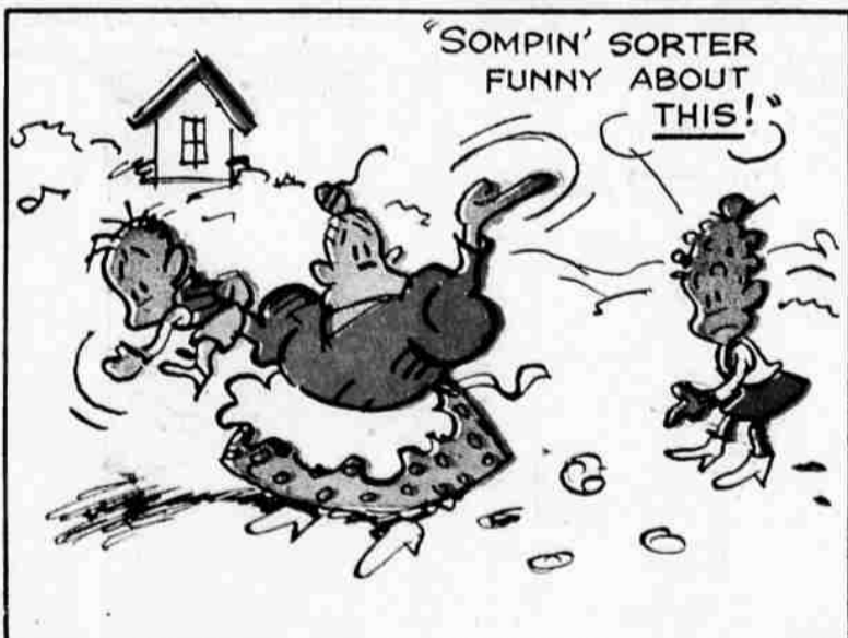
"SOMPIN' SORTER FUNNY ABOUT THIS!"