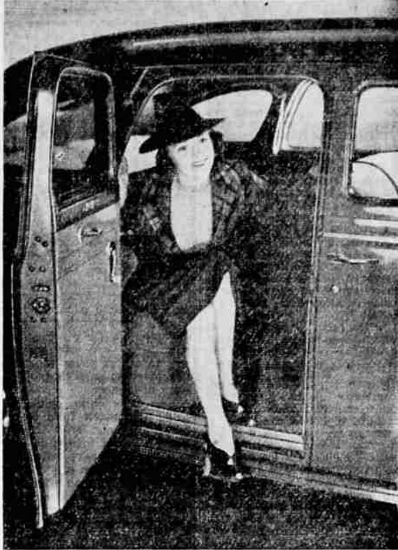
Large, full-width, walk-in doors are among the new comfort items found on the four-door Sedans of the 1940 line of the Dodge Luxury Liner. The construction of the doors, giving easy access to wider seats, makes it possible to lower windows all the way down, for maximum ventilation.