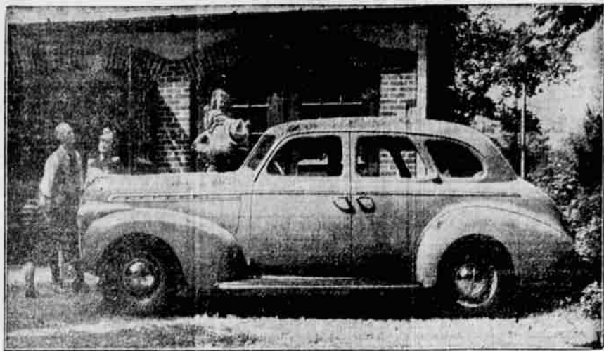
New 1940 Chevrolet Master De Luxe Sport Sedan