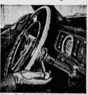
New, Perfected Handy-Shift—It's easier, faster... reduces gear-shifting to a flick of the wrist.

Look—Ride—then Decide! Drive De Soto before you buy! DE SOTO DIVISION OF CHRYSLER CORPORATION, Detroit, Michigan. MAJOR BOWES, C.B.S. NETWORK, THURS., 9 TO 10 P.M., E.S.T.