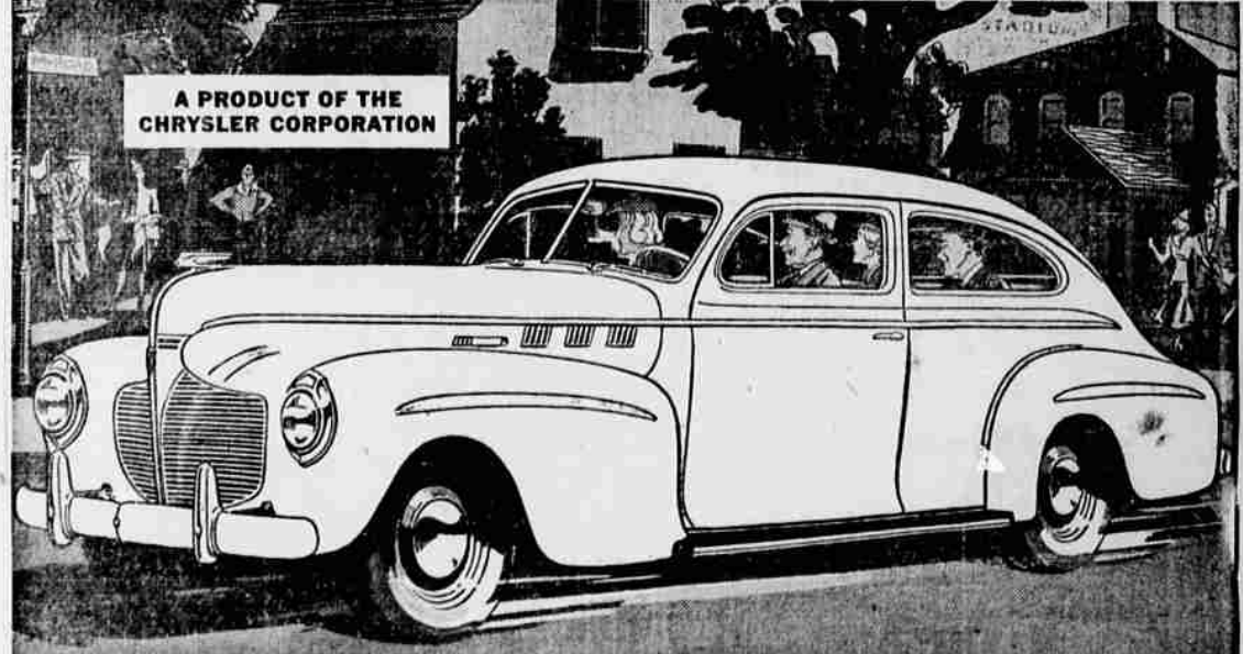
A PRODUCT OF THE CHRYSLER CORPORATION