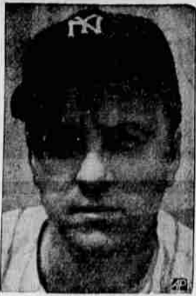
MONTE PEARSON Monte Pearson (above), Yankee right-hander, turned in one of the finest pitching performances in world series history today when he gave up only two singles in blanking the Cincinnati Reds, 4 to 0. The New York victory gave them a 2 to 0 lead in the series.