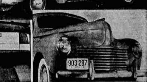
Striking front view of the "Beautiful Chrysler for 1940", 6-passenger sedan. Note the longer hood, cleaner lines and attractive radiator grille with horizontal chrome molding.

Completely redesigned and restyled, the Chrysler line for 1940 represents what the company considers its outstanding achievement in beauty. It is, in fact, an entirely new line with beauty so definitely the motif that in all its advertising the promotion efforts the company refers to the cars as the "Beautiful Chryslers for 1940". Along with its improved appearance, the car has been bettered mechanically in many respects. The result is that it has an improved performance, added comfort, greater safety and superlative riding qualities to match its eye appeal.