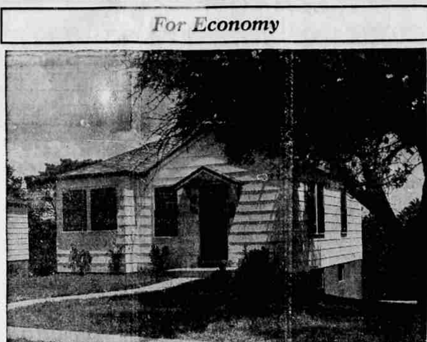
From the standpoint of economy and effective use of space, this home could well be a model for hundreds to copy. Containing an ample living room, two bedrooms, kitchen, and bath, the house is a compact living unit for a small family.

Pointing out that undoubtedly some families have been frightened out of the notion of home building as a result of the uncertainties of war, Mr. Thierolf declared that it was equally true that stimulated business and the prospect of steady employment in war-affected industries was at the same time bringing new home building prospects into the market.