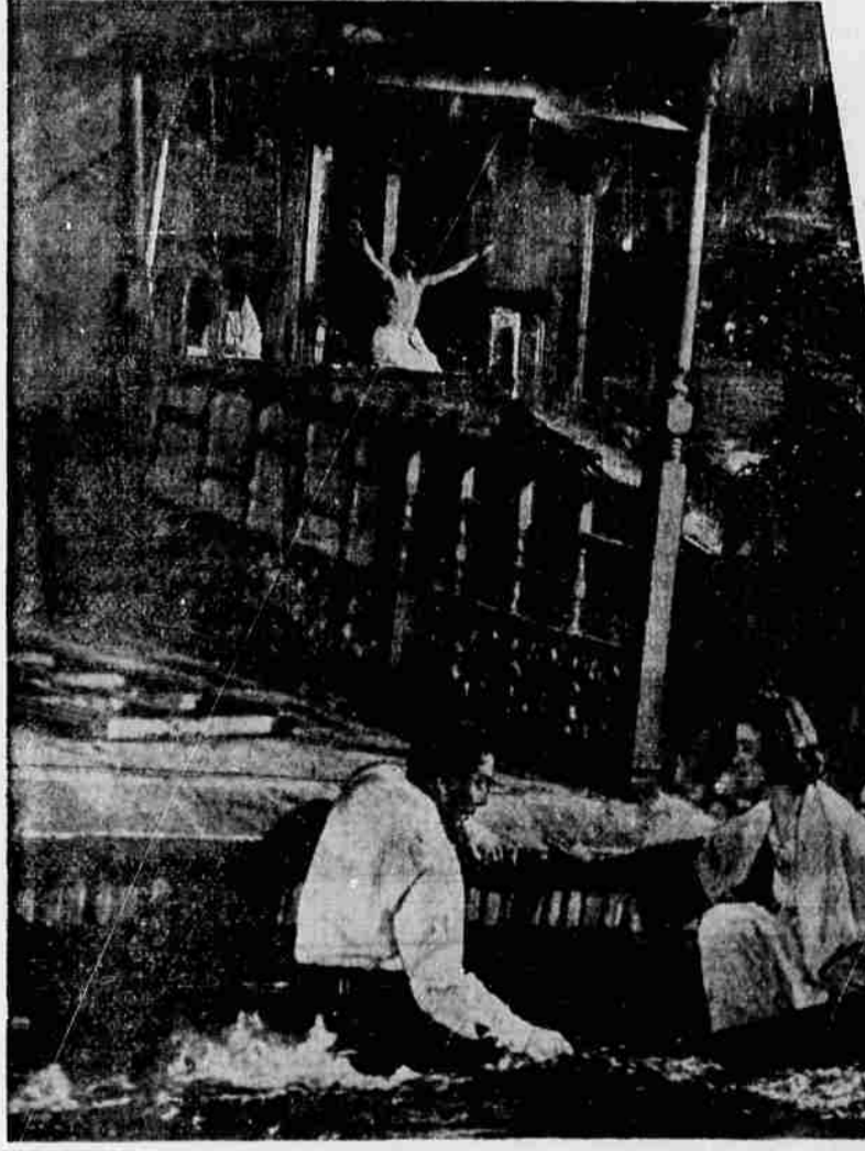
FLOOD! Fed by the still-pouring rains, the terrible flood waters continue to rise, until even the ruined refuge of Tom and Edwina is threatened. They take to a flimsy boat to escape certain doom.