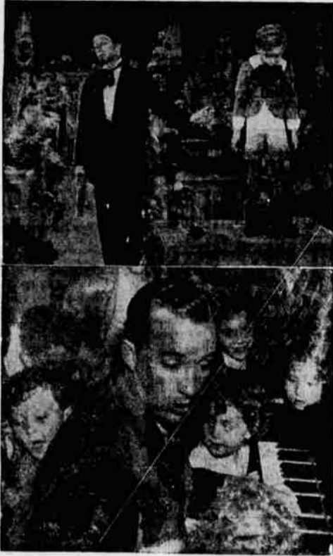
Oldsters and youngsters will thrill as Bing and these talented kiddies sing "School Days, School Days" and a dozen other old favorites. It's Bing Crosby in the best of all his roles, the title role of "The Star Maker," glorious song-studded picture suggested by the life of that song-writing, star-making showman, Gus Edwards. In the picture, which comes to the Craterian theatre for a three-day run starting Sunday, Bing makes stars out of talented kiddies, sings all of Gus' tunes, and four new hits.