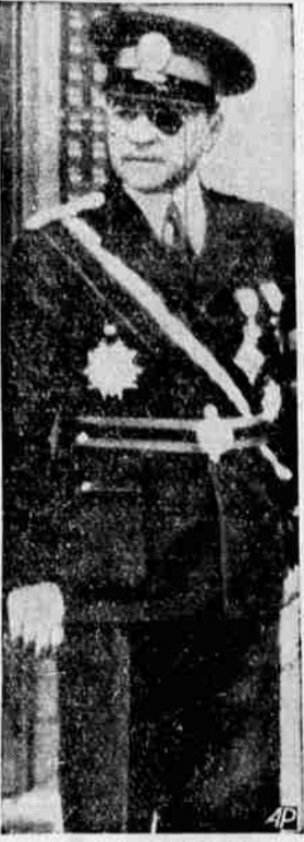
With six bullets in his chest and abdomen, Prime Minister Armand Calinescu (above), was slain yesterday while driving in his auto along one of Bucharest's principal streets. His slayers were believed to be Iron Guards and a coup was feared.