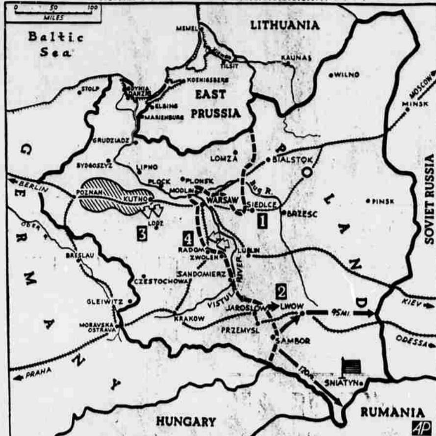
This map emphasizes Poland's principal rail lines, vital links between Germany and Russia, and shows hot spots on the eastern front. Germans claimed virtual encirclement of Warsaw and had crossed railway east of city (1). Nazi vanguard reported at Lwow (2). In "mystery area" (shaded) some 60,000 Poles were battling to get out of "pocket." On Radom front (4), another battle in progress. Black arrows indicate direction of German drives; white arrows, Polish movements; broken line, approximate battle front. American flag denotes U. S. embassy at Sniatyn.