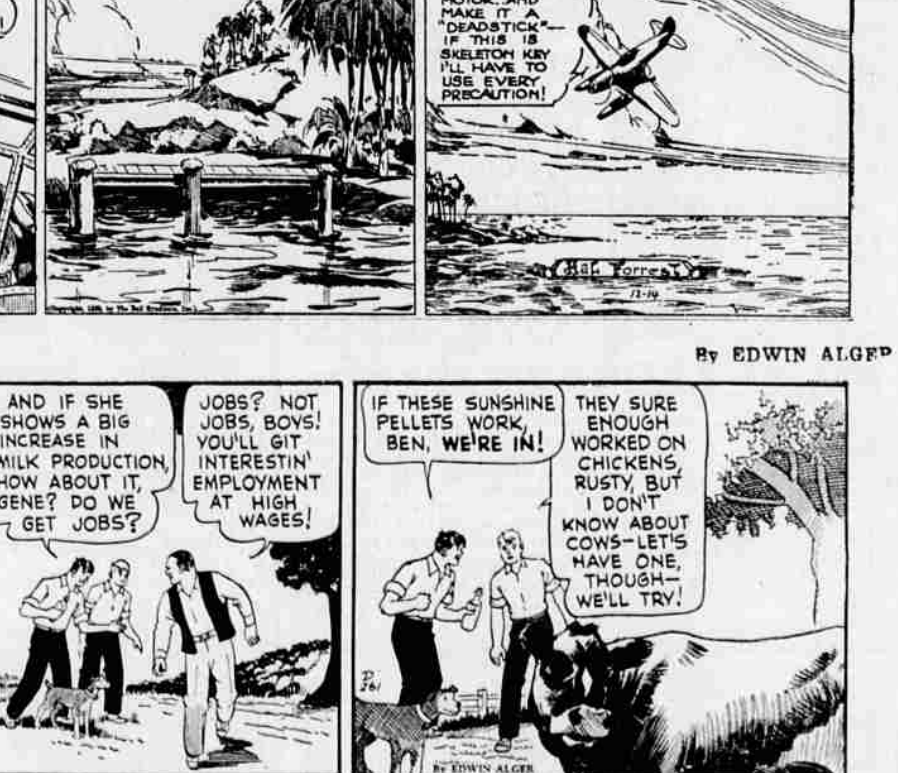
(Copyright, 1938, by The Bell Syndicate, Inc.)