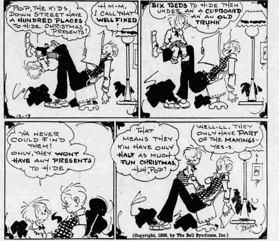
(Copyright, 1938, by The Bell Syndicate, Inc.)