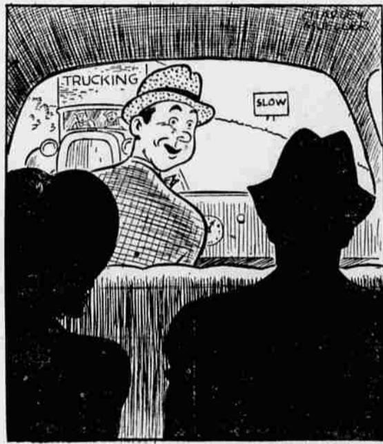
So I see, "You can't fool a guy who keeps his eyes open . . ."