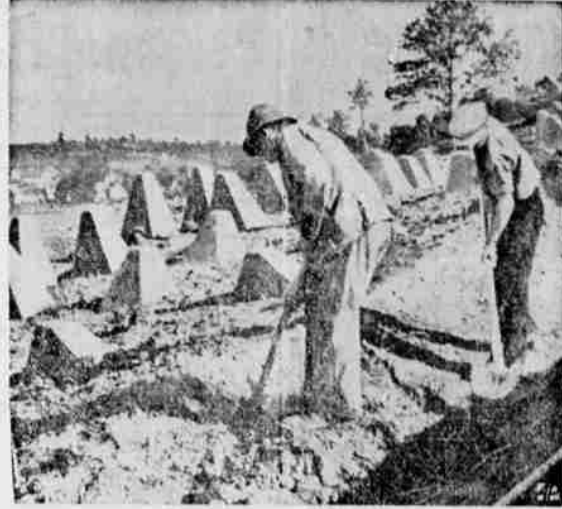
THEY SHALL NOT PASS, decided Germany, thinking of enemy tanks, and so teeth-like concrete blocks designed to rip off tanks' caterpillar treads supplement the Limes steel and stone defenses. The fortifications, built to match France's Maginot line, is to be finished this winter