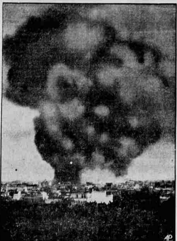
This was the sight that greeted Japanese soldiers when they reached Canton—the city in flames as the result of the Chinese carrying out the "scorched earth" policy. The fires raged over much of the native section of the city but remained clear of the American concession.