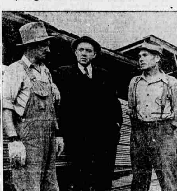
In every city he visits in his campaign, Charles A. Sprague, republican candidate for governor continues his plan of seeking the views of the men in the mills and factories. The cameraman caught him talking to two men at a Grants Pass box factory.

In Budapest, Hungary, you pay a fare, usually about two cents, to go up in an elevator in the fine modern apartments; the fare doubles after midnight. Most folk ride up and walk down.