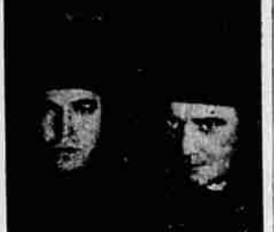
Richard Dix and Chester Morris have the two male leads in "Sky Giant," the dramatic story of two daring pilots who blaze the trail for transcontinental flying via the frozen skies of the North Pole and Asia. Joan Fontaine has the leading feminine role as the girl dear to the hearts of both flyers. Harry Carey and Paul Guilfoyle make up the rest of the action-packed cast. "Colorado Trail," starring Charles Starrett, will play as the companion thrill hit.