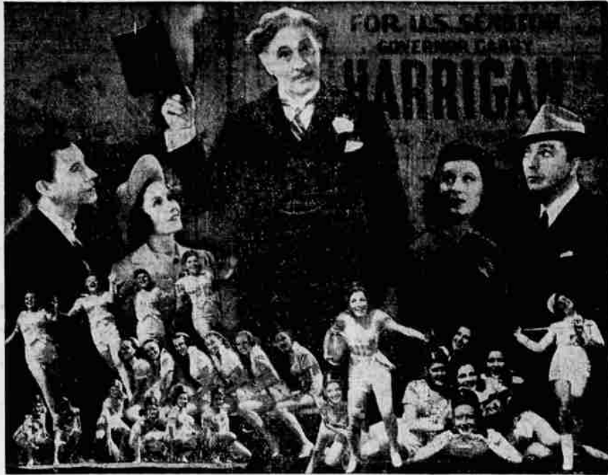
John Barrymore is in all his glory as a vote-chasing, co-ed kissing, budget-bouncing governor who goes collegiate in "Hold That Co-ed," coming to the Craterian theatre Sunday for a three day run. George Murphy, Marjorie Weaver, John (Limp-Dimp) Joan Davis introduced in the comedy, featuring "Limp-Dimp," Joan Davis' newest actionful song-dance.