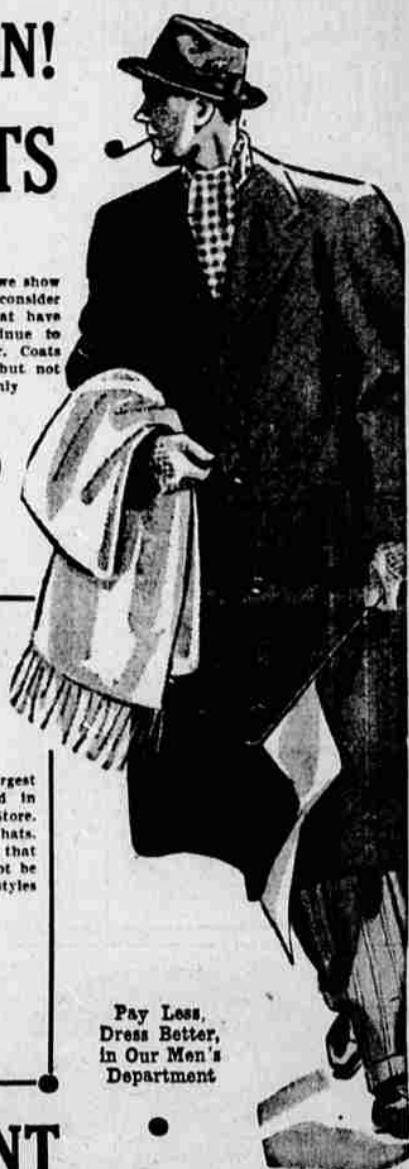
Pay Less, Dress Better, in Our Men's Department