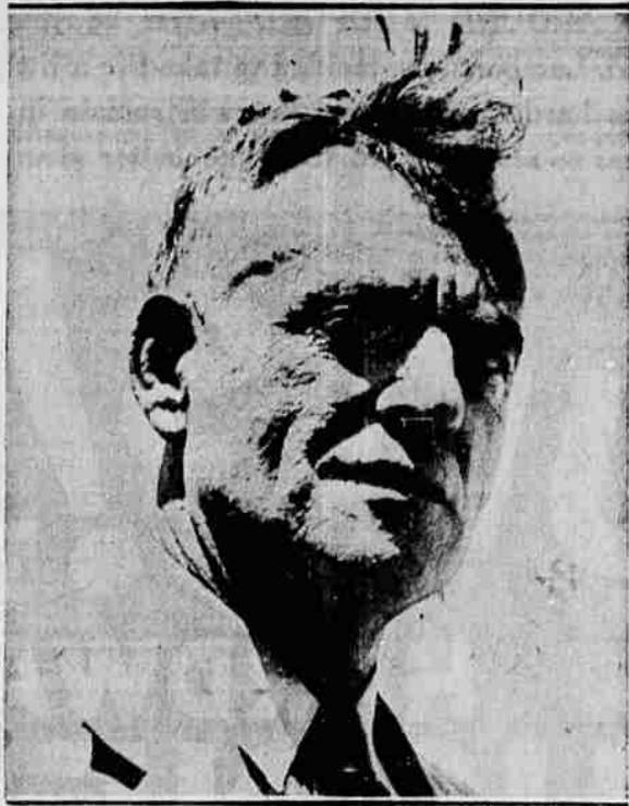
Roy Gardner, notorious ex-train robber and prison escape artist, who will appear on the stage of the Rialto theater at all shows Sunday and Monday. Gardner says he is out of prison this time for good.

Roy Gardner was back in Medford today after a lapse of 17 years.