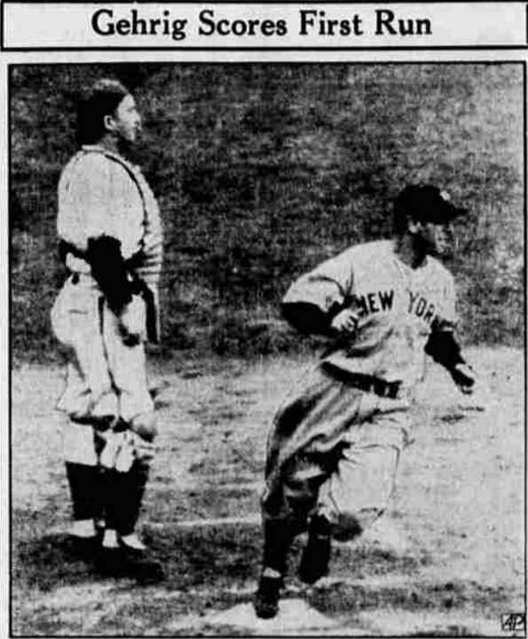
Gehrig Scores First Run To Lou Gehrig, Yankee first baseman, went the honor of scoring the first run of the 1938 world series. Here he is crossing home-plate in the second inning of the game at Wrigley field in Chicago, while Manager and Catcher Gabby Hartnett stands helplessly by. H. had walked and came in on Selkirk's bouncer which Billy Herman fumbled.

BOOMING HOMERS IN LAST INNINGS ROUT DIZZY DEAN DiMaggio, Crosetti Connect -- Gomez, Though Lifted, Given Win Credit -- Marty and Great Dean Star.