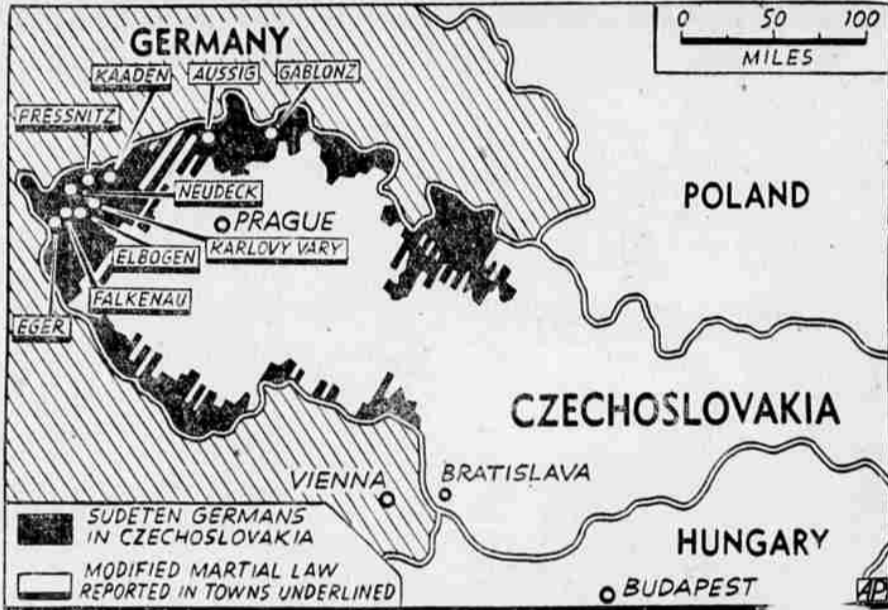
Czech tanks, like those above, rumbled through the streets of Eger, less than ten miles from the German border as martial law was clamped down on many Sudeten districts following a series of disorders. The tanks, latest of the ten-ton Czech army equipment, were made in the Skoda plants. The accompanying map shows the martial law districts, with the exception of Boheimisch-Kerman, not shown.